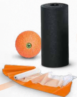
Helpful, tried and tested training equipment