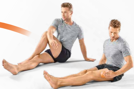
special training exercises